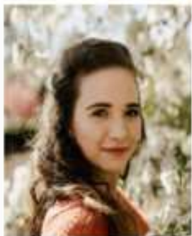
By CARLY NEW

For those attending in person, either bring your own meal or eat before you come. No meal will be provided at this meeting.