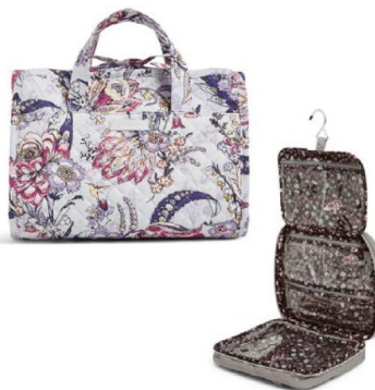
HANGING TRAVEL ORGANIZER