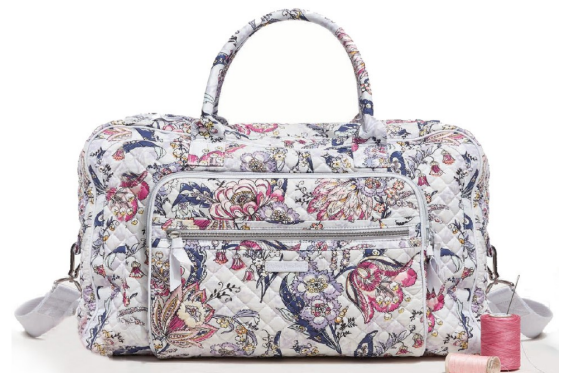
COMPACT WEEKENDER BAG