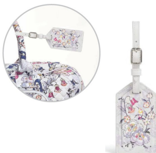
WHIMSY LUGGAGE TAG